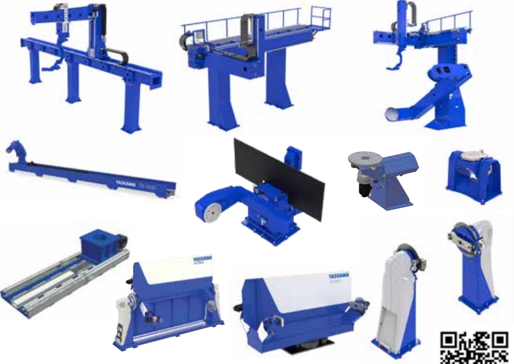
View full range of Positioners, Tracks and Gantries.

Yaskawa's extensive welding experience offers standard and custom workpiece positioners with precise multi-axis control, speed, and precision. This encompasses compatible Tracks and Gantries for all applications, setting RA apart as trusted advisors in system design without compromise.