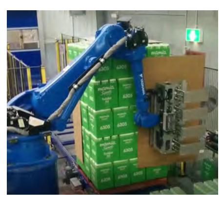
Automation of Corner Protectors