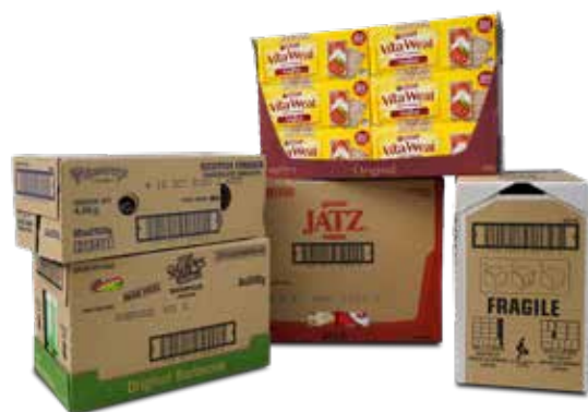
Example of shelf ready product cartons.